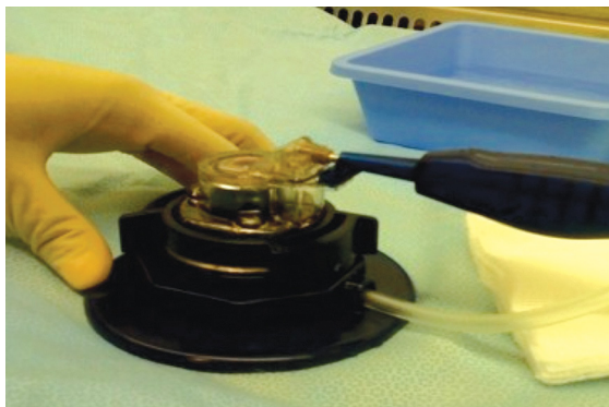
Fig. 1A. The Horizon DSAEK system.