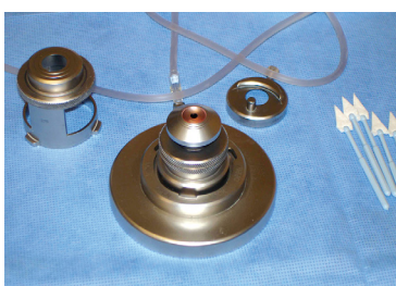
Fig. 1B. The Moria artificial anterior chamber system.

Precut tissue from eye banks presents several inherent advantages, including increased surgeon efficiency, decreased surgical center expense (microkeratome blades, nitrogen gas, and an artificial anterior chamber and lamellar equipment), and avoidance of intraoperative donor tissue perforation during preparation. 10,11